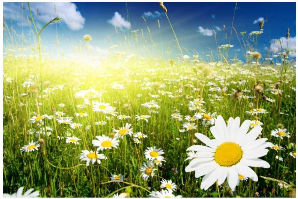
Psalm 104:30 You send forth your spirit, they are created: and you renew the face of the earth.