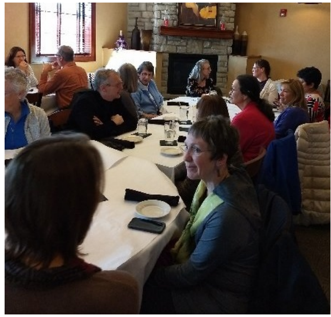
There were 32 CPEH from 10 states (adding New York and Massachusetts) attending the 2018 NAEH Conference.