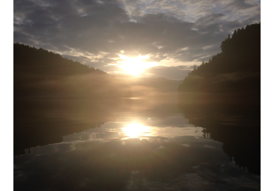
The Angel of the Presence

Every human being is, in reality, like a miniature whirlpool in that great ocean of Being in which he lives and moves-----ceaselessly in motion until such time as the soul "breathes upon the waters" or (forces) and the Angel of the Presence descends into the whirlpool. Then all becomes still. The waters stirred by the rhythm of life, and later stirred violently by the descent of the Angel, respond to the Angel's healing power and are changed into a quiet pool into which the little ones can enter and find the healing which they need. (17-140)