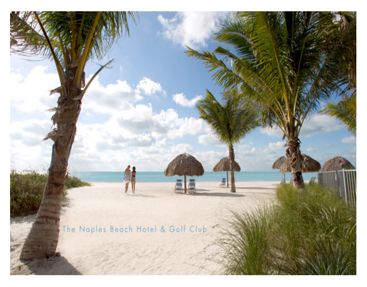
Dress colorfully, casually and comfortably for a pleasant tropical experience. Include a shawl or sweater for indoor air-conditioned areas. Don't forget your bathing suit and sunscreen!